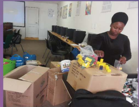
Preparation for Lukhanyo Primary School Parents resources.