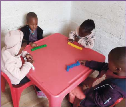
Maths skills at Phaphama