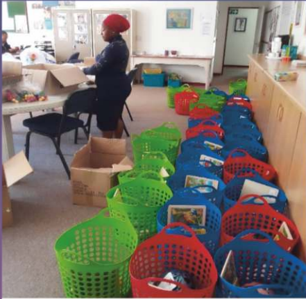
The preparation for Zwelihle Pre-Primary resources.