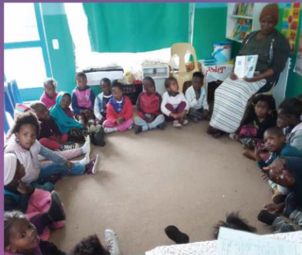
Story telling at Nomzamo ages 4-5 yrs