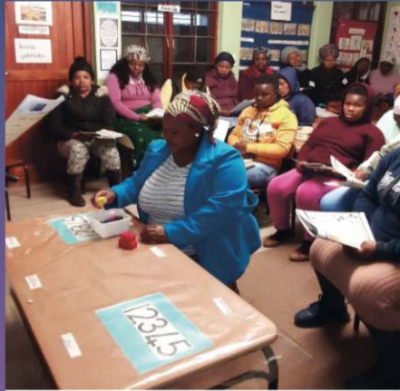
Zwelihle parent demonstrating a lesson in maths