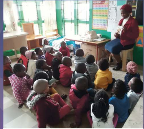
Story telling at Nomzamo ECD Centre ages 3-4 yrs.