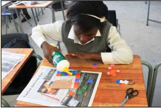
Visual Art & Craft