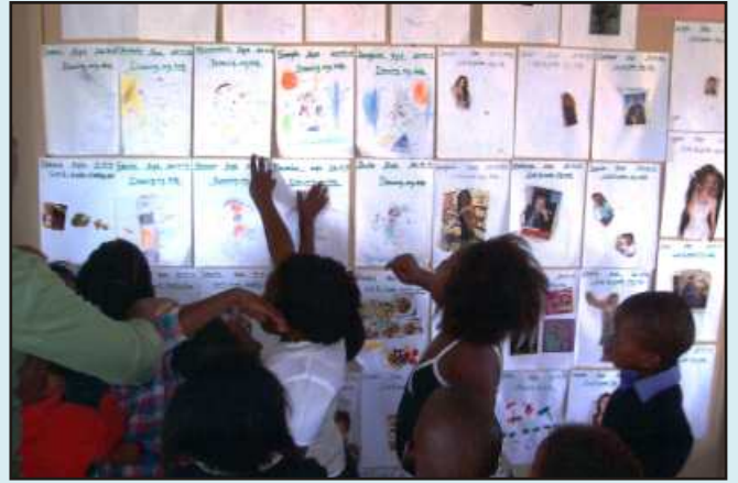
Early Childhood Development