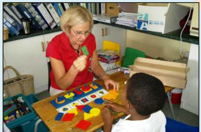
Enrichment for Foundation Phase learners