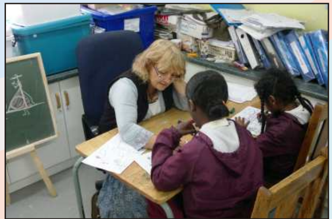
Enrichment for Foundation Phase learners