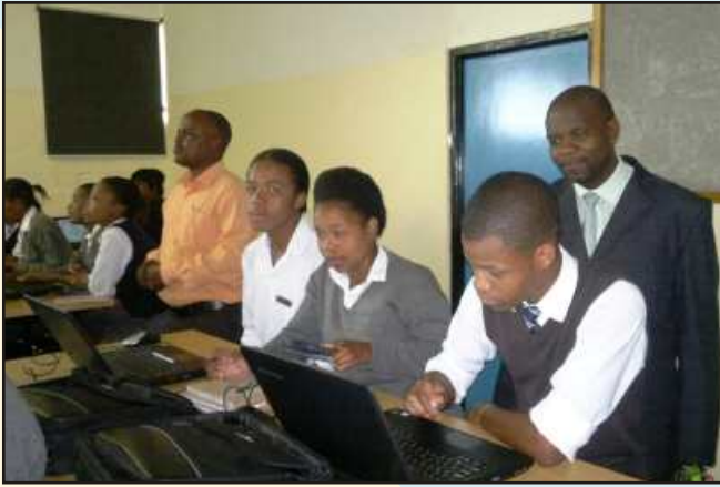
Big Vision Project