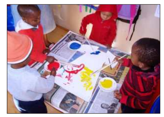
Early Childhood Development Programme

"I make children spell correctly: I make them walk on air; I make parents see their children in a way they never did before; I make an under-achiever reach the top of his class; you want to know what I make. I make a difference."