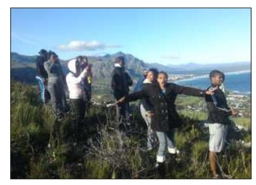
67 Minutes for Mandela Day